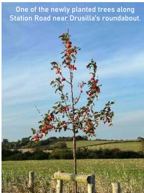
One of the newly planted trees along Station Road near Drusilla's roundabout.